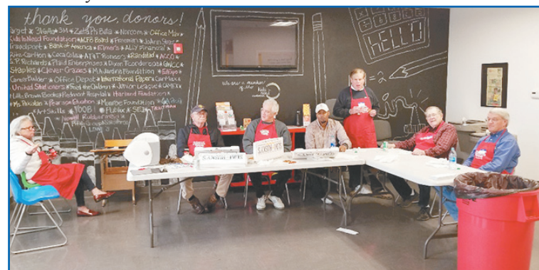
Northside volunteers at Santa's Village