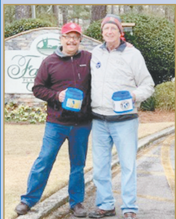
Ready for collection

Kiwanis Club thanks the Fairfield Plantation Community for their generosity to help the people in need. Much appreciation goes to Kiwanians and Scouts who collected and Jones-Wynn organization for providing the tents.