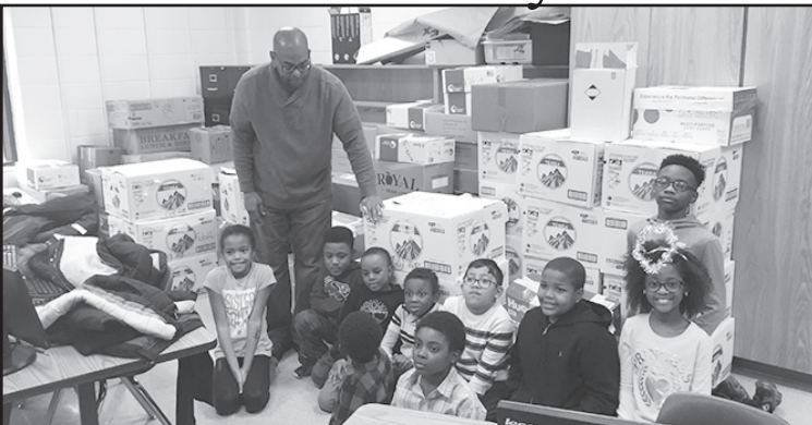
Fickett Elementary K-Kids surrounded by boxes of canned goods which they collected for the Hosea Feed the Hungry project.