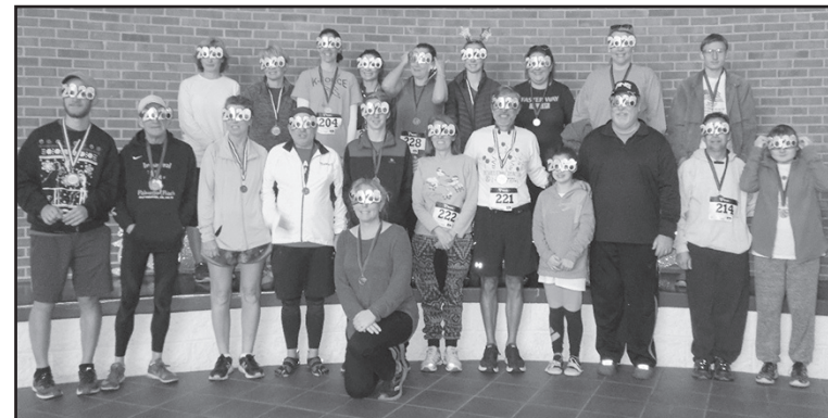
Some of the Resolution Runners celebrating the incoming 2020 New Year.