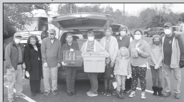
Kiwanis members handing out bags of cotton candy & popcorn at the Drive in Movie downtown Swainsboro

Santa was at the entrance to greet the car loads of eager movie goers and the cotton candy, popcorn and water were handed out by twelve of the Swainsboro Kiwanians. Everyone enjoyed the two movies and had a great time.”