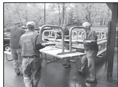
Photos from the District Service Project at the Little White House in Warm Springs GA on April 10 2021. We assembled 12 picnic tables in preparation for the ceremony recognizing the death of President Roosevelt on April; 12th. 21 Kiwanians participated.