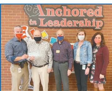
Pickett's Mill Elementary