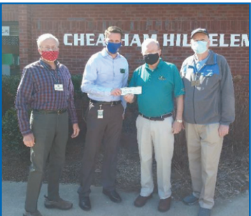
Cheatham Hill Elementary

Thank you to our board members and committee members who recognized these special needs in our schools and moved to support them during a very difficult time.