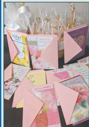
The Kiwanis Club of Golden K Columbus made treats and cards for the families at a women and children’s center in Columbus for Mother’s Day.