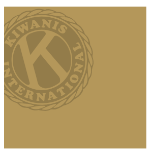
20% black multiplied at 100% 30% black multiplied at 100%

The Seal can also be cropped, but readability must be maintained.