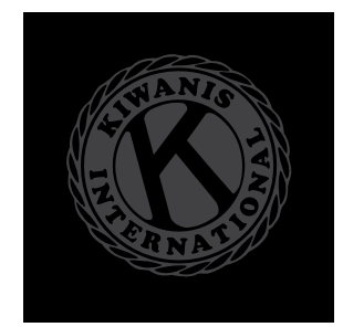
90% black normal